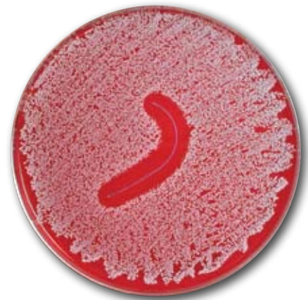
Photo of an actual VICRYL* Plus suture creating a zone of inhibition to prevent Staph E bacterial colonization.